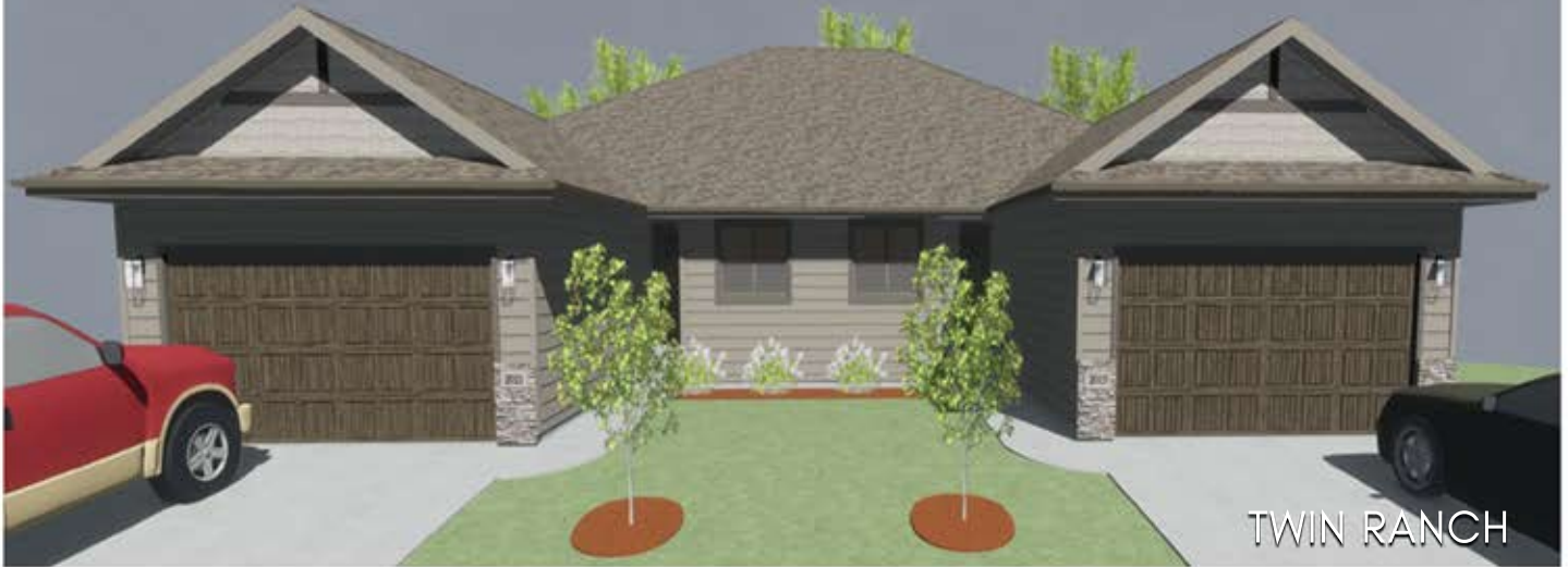
Images included in flyer are for marketing purposes only and may not represent completed home. Pricing subject to change.