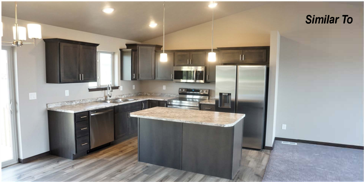
Selection package included is for marketing use only. Features and finishes may not be identical to completed home.