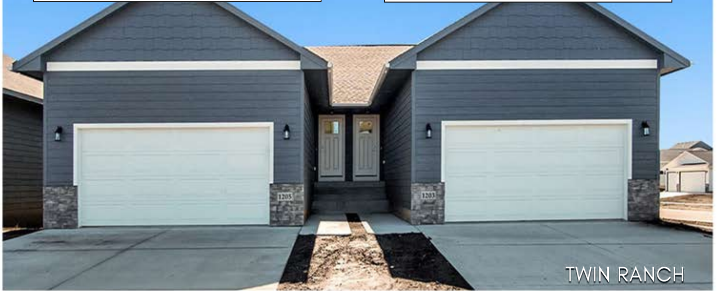
Images included in flyer are for marketing purposes only and may not represent completed home. Pricing subject to change.