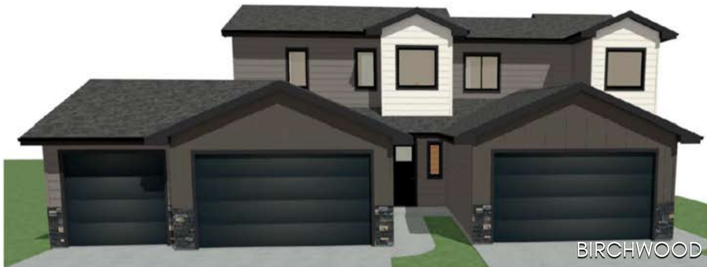
Images included in flyer are for marketing purposes only and may not represent completed home. Pricing subject to change.

902 E WAYNE PLACE Nine Mile Creek at Serenity Park - Tea, SD $349,800