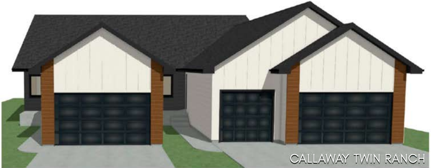
Images included in flyer are for marketing purposes only and may not represent completed home. Pricing subject to change.

1638 CONNOR CT Westbrook Estates - Yankton, SD $363,800